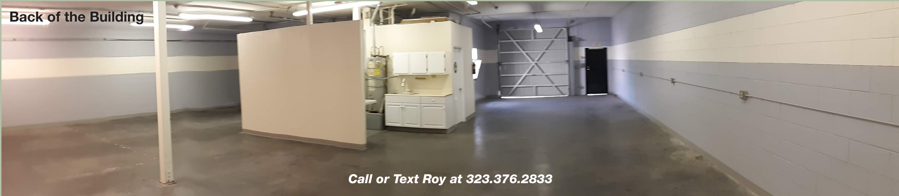
Back of the Building

Disclaimer: the dimensions set forth in this floor plan are good faith estimates by owner. They are not a warranty of actual dimensions. Prospective tenants are advised to take their own measurements.