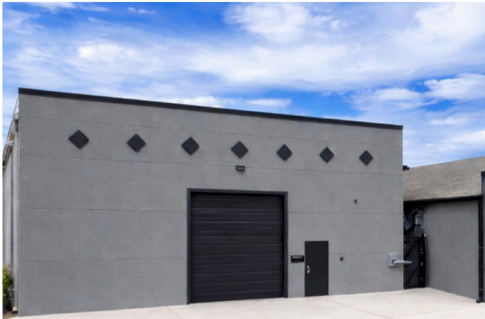
CONCEPTUAL RENDERING OF EXTERIOR IMPROVEMENTS

COLDWELL BANKER COMMERCIAL ARNOLD AND ASSOCIATES