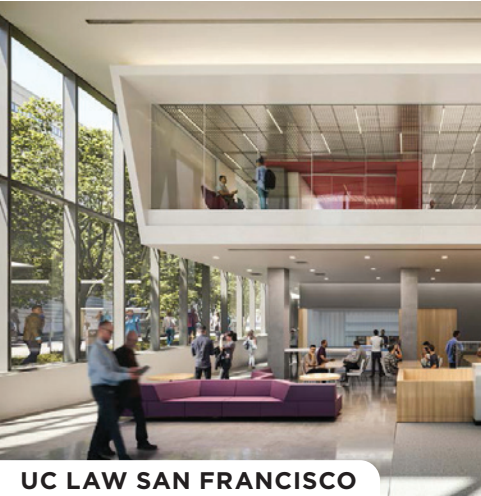
UC LAW SAN FRANCISCO