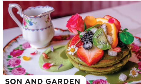
SON AND GARDEN