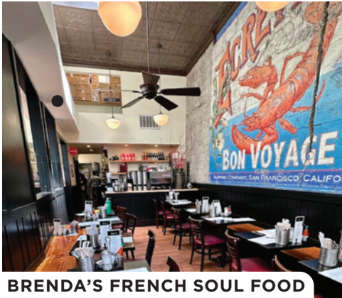
BRENDA'S FRENCH SOUL FOOD