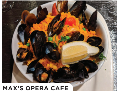
MAX'S OPERA CAFE