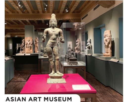
ASIAN ART MUSEUM