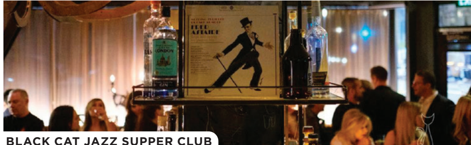
BLACK CAT JAZZ SUPPER CLUB