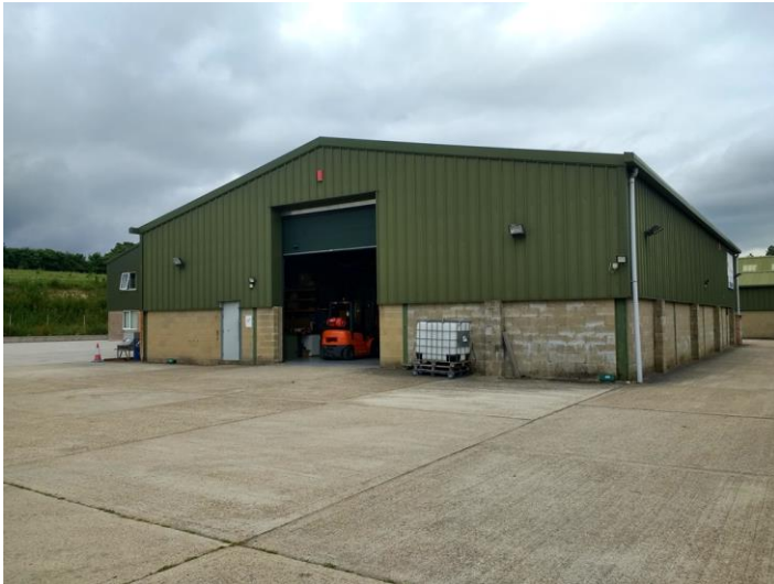
UNIT 1 7,278 sq.ft. (676.3 sq.m) GIA