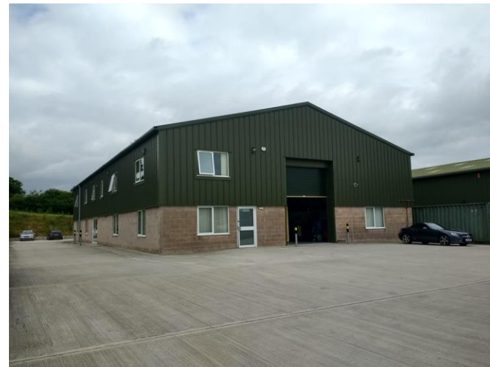
UNIT 4 8,031 sq.ft. (764.3 sq.m) GIA