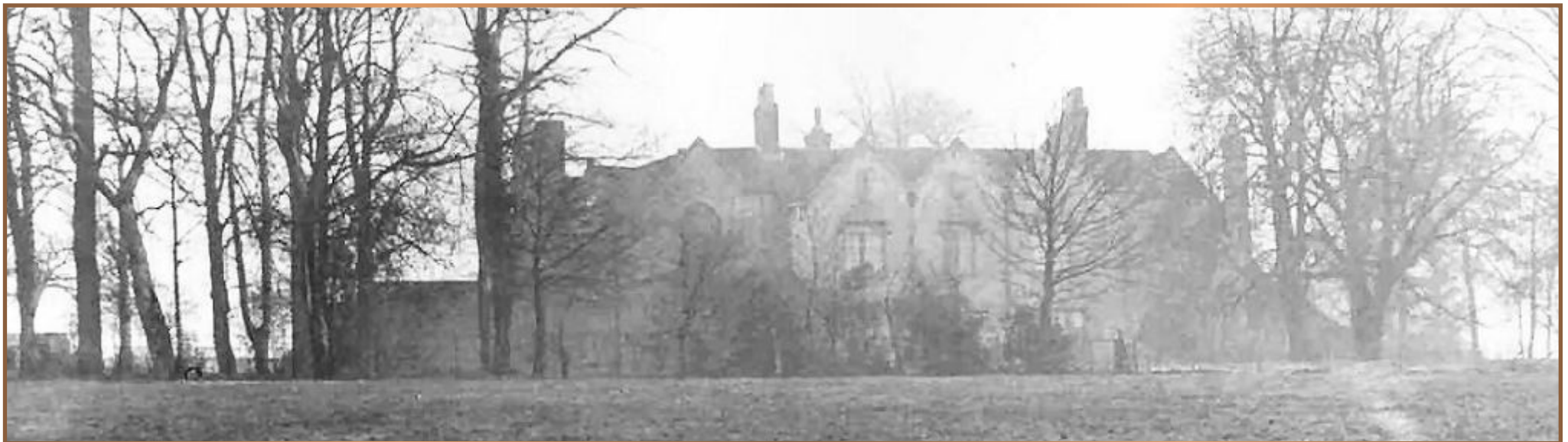
Hay Hall, early 20th century (Birmingham Libraries)