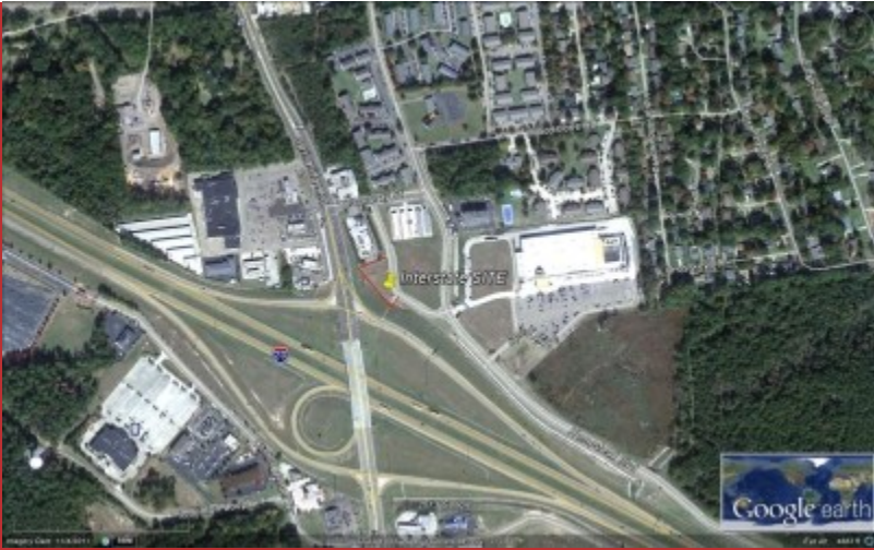
VIEW OF INTERSTATE LOCATION

Great Interstate Visibility. Lot has multiple commercial use opportunities. Restaurant, Office and Quick Facility site.