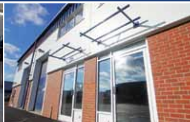
Indicative photos of similar scheme