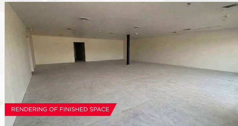
RENDERING OF FINISHED SPACE