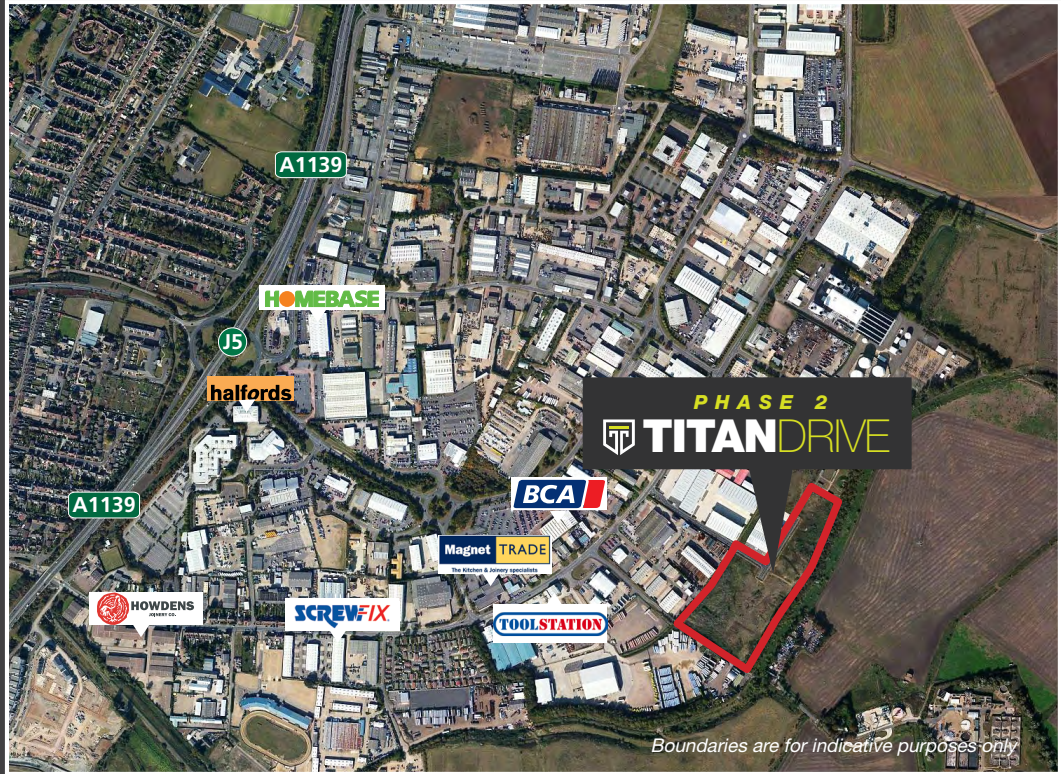
Boundaries are for indicative purposes only

Nearby occupiers include Perkins Engines, Ridgeons, British Car Auctions, Magnet, Screwfix, Howdens, Toolstation and retail warehouse users such as Homebase and Halfords, as well as several major car dealerships.