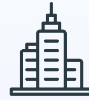
2022 TOTAL BUSINESSES