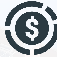
2022 AVERAGE HH INCOME