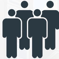
2022 DAYTIME POPULATION