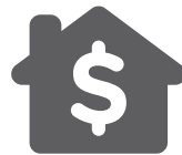
Average HH Income