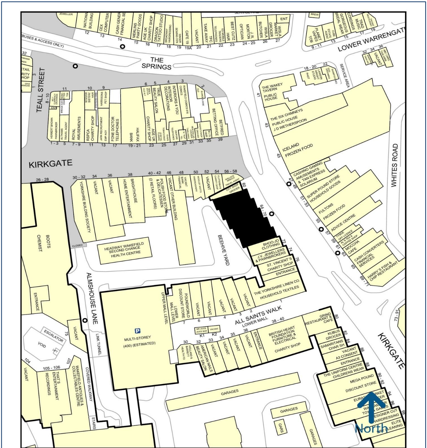
Experian Goad Plan Created: 04/10/2017