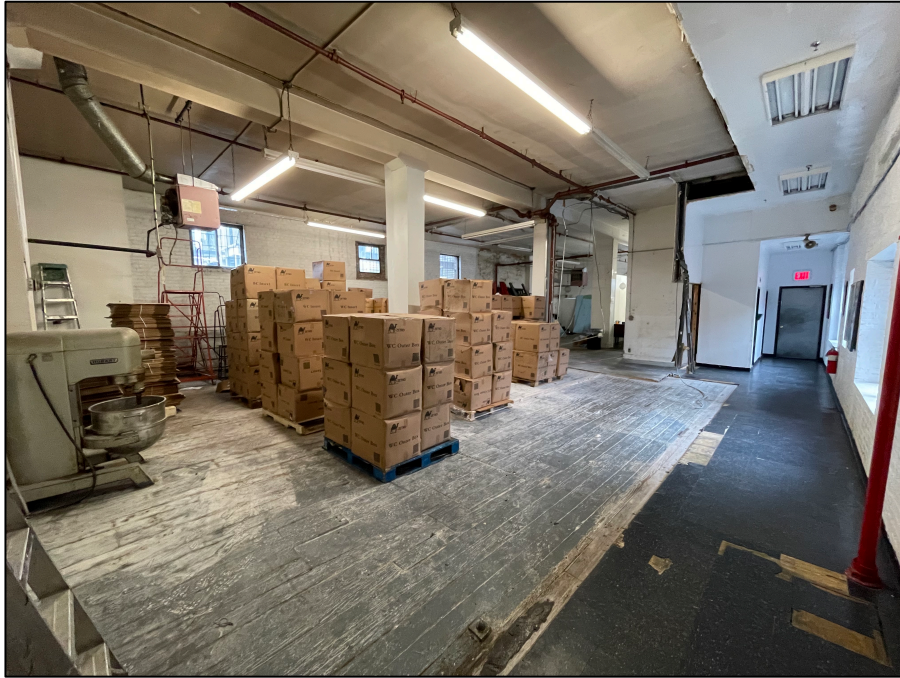
Interior Space – 2 nd Floor