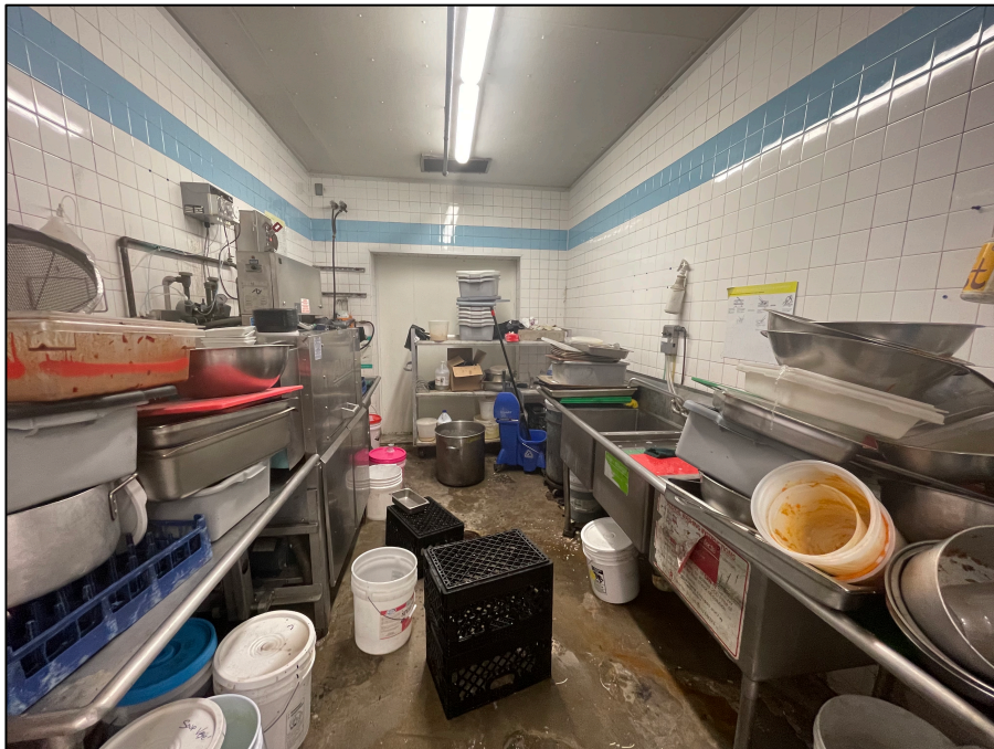
Interior Space – 1 st Floor