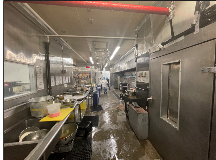
Interior Space – 1 st Floor