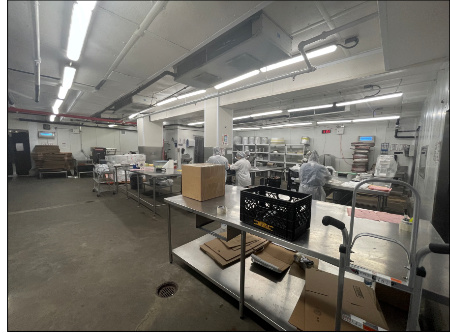
Interior Space – 1 st Floor