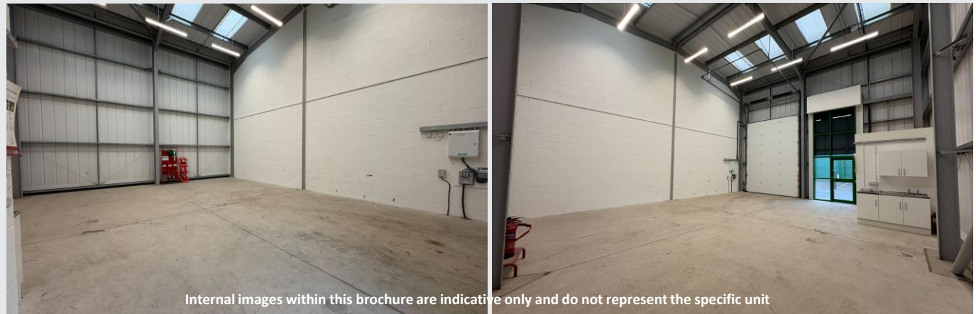
Internal images within this brochure are indicative only and do not represent the specific unit