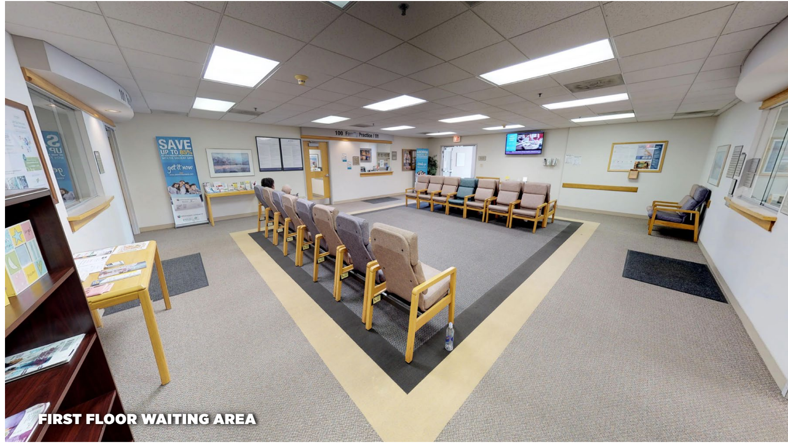
FIRST FLOOR WAITING AREA