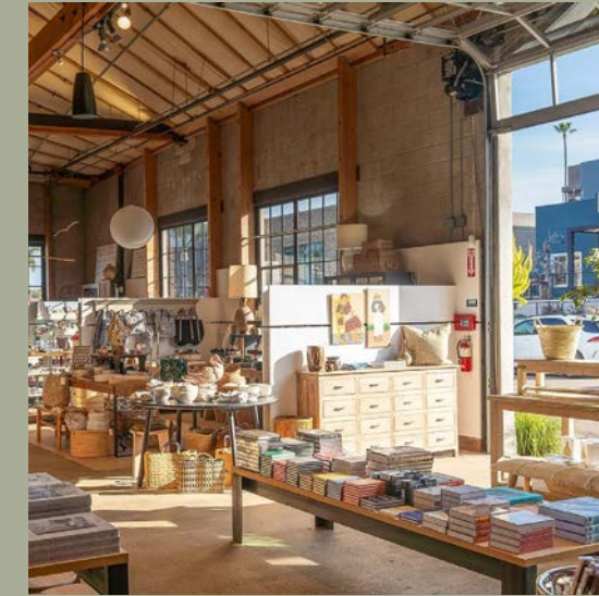
SOLO ON CEDROS