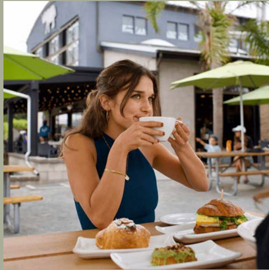
LOFTY COFFEE CO.