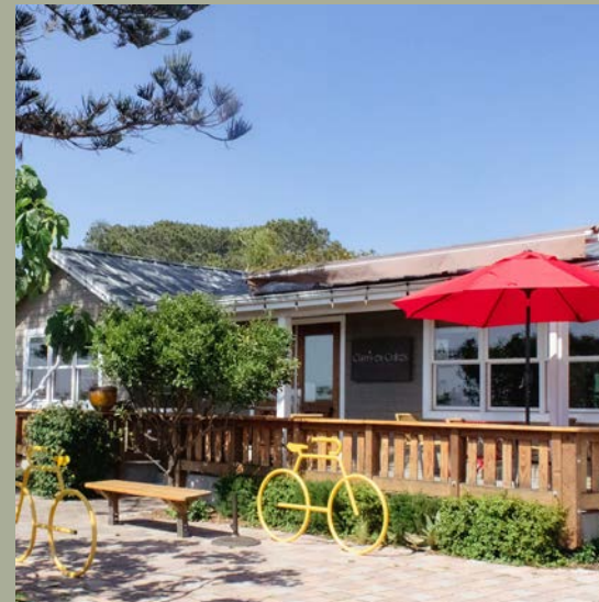
CLAIRE'S ON CEDROS