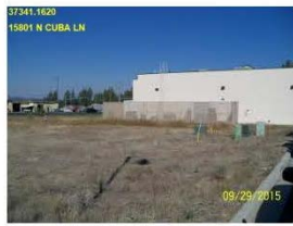
15801 N Cuba Lane Parcel # 37341.1620