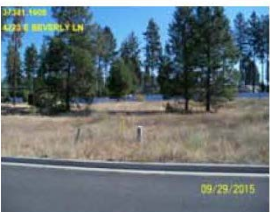
4223 E. Beverly Lane Parcel # 37341.1608