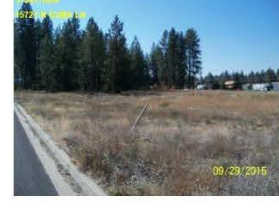
15721 N Cuba Lane Parcel # 37341.1604