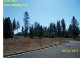
4224 E Beverly Lane Parcel # 37341.1607