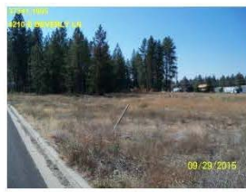
4217 E Beverly Lane Parcel # 37341.1609