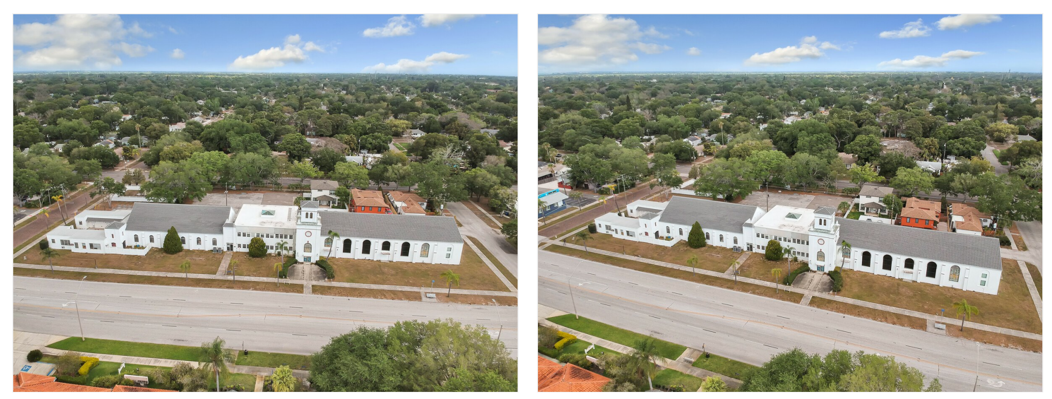
Central Aerial (8)