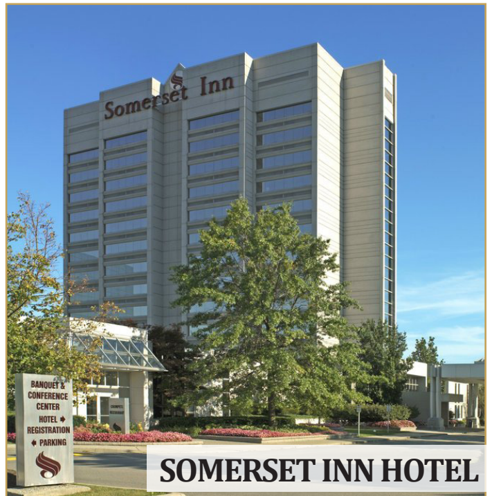
SOMERSET INN HOTEL