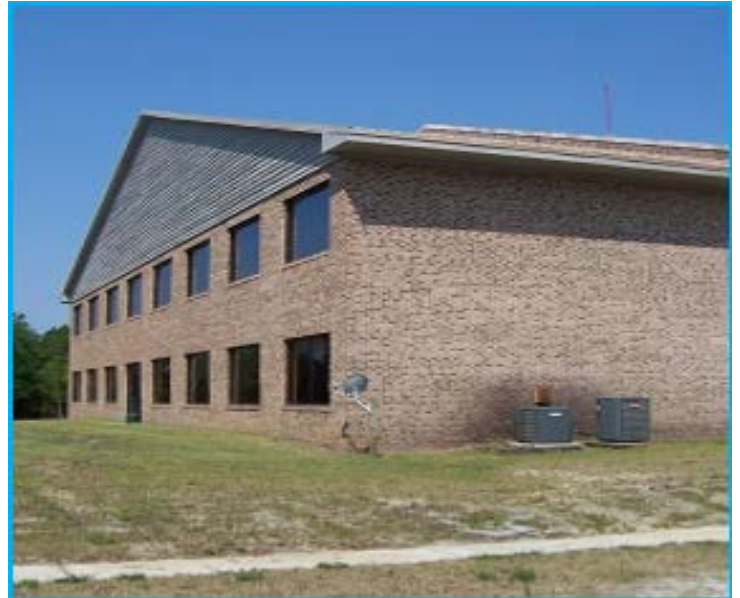
3310 Fredrickson Aerial