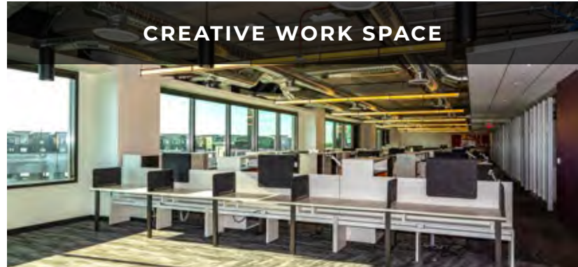
CREATIVE WORK SPACE