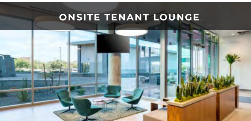
ONSITE TENANT LOUNGE