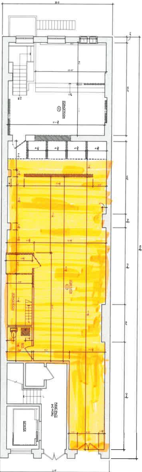
1 EXISTING GROUND & REMOVAL FLOOR PLAN SCALE: 1/8" = 1'-0"