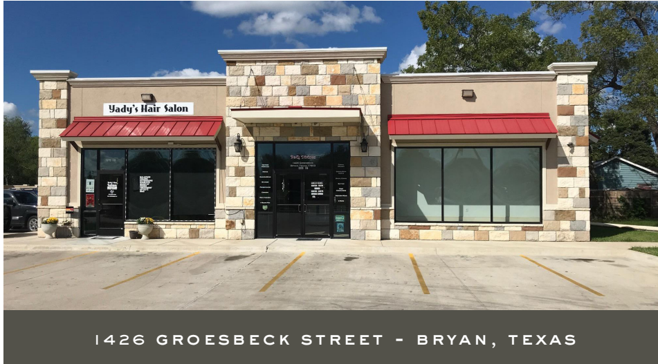
1426 GROESBECK STREET - BRYAN, TEXAS