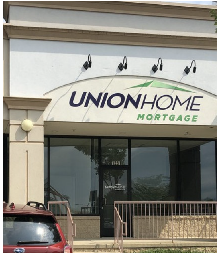
2,000 SF Commercial Space