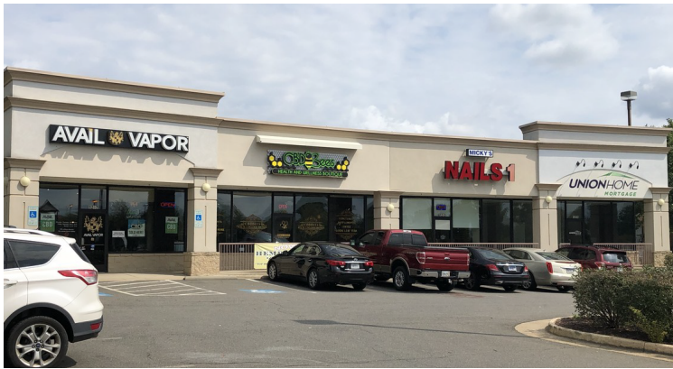
End Cap Unit