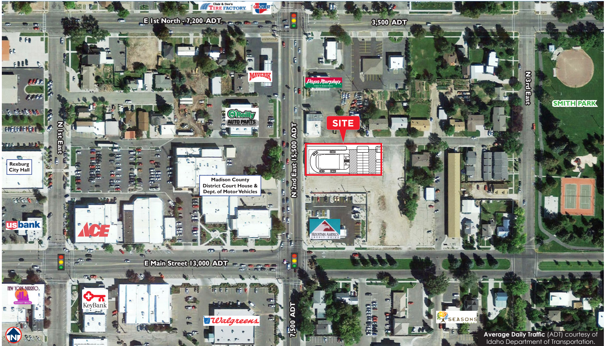
Average Daily Traffic (ADT) courtesy of Idaho Department of Transportation.