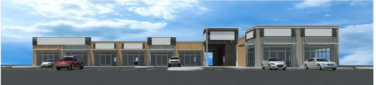
1- 3D VIEW FRONT ELEVATION