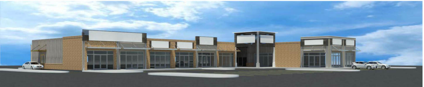
2- 3D VIEW RIGHT SIDE

BRAD TOY, CCIM | brad.toy@wilsonkibler.com | 864.640.7429