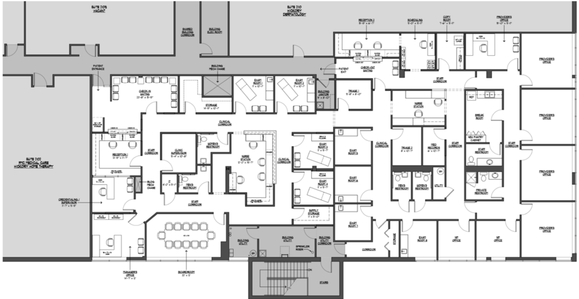
*POSSIBLE PLAN FOR COMBINING SUITES 2101 & 2108