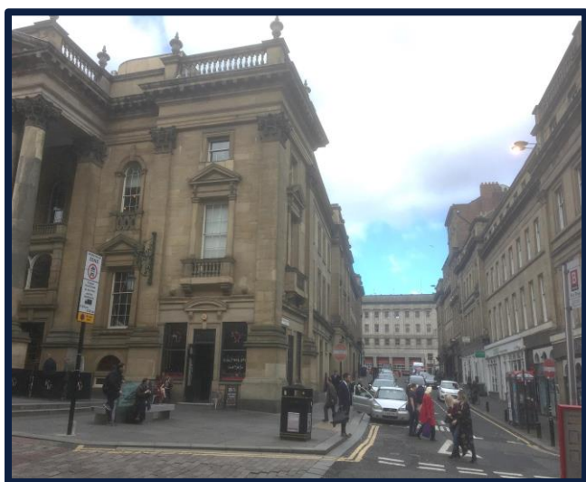
Shakespeare Street View

£7,600 plus VAT per annum, based upon a rate of £11.50 plus VAT per sq ft per annum for the first three years of the term.