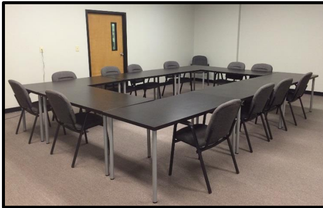
Large conference room available to you.