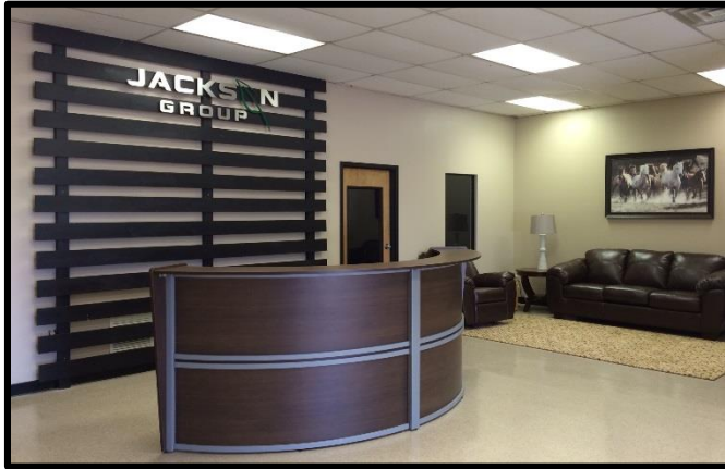
Large lobby area to greet your customers.