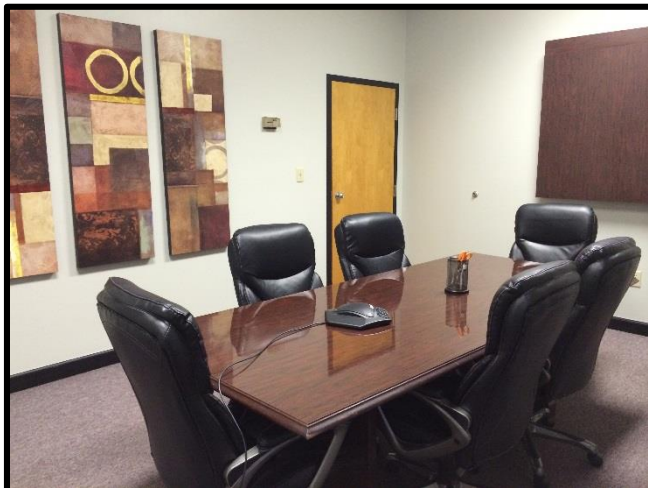
Additional meeting rooms offered for whatever your needs may be.