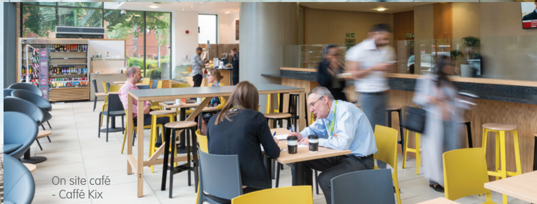
On site café - Caffé Kix