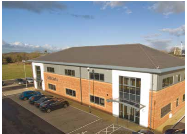
Examples of previous Robert Hitchens Developments in Stonehouse