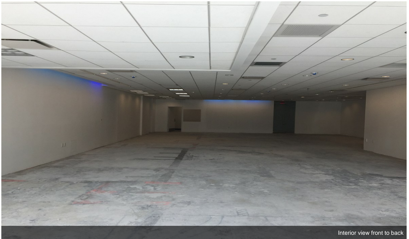
Interior view front to back