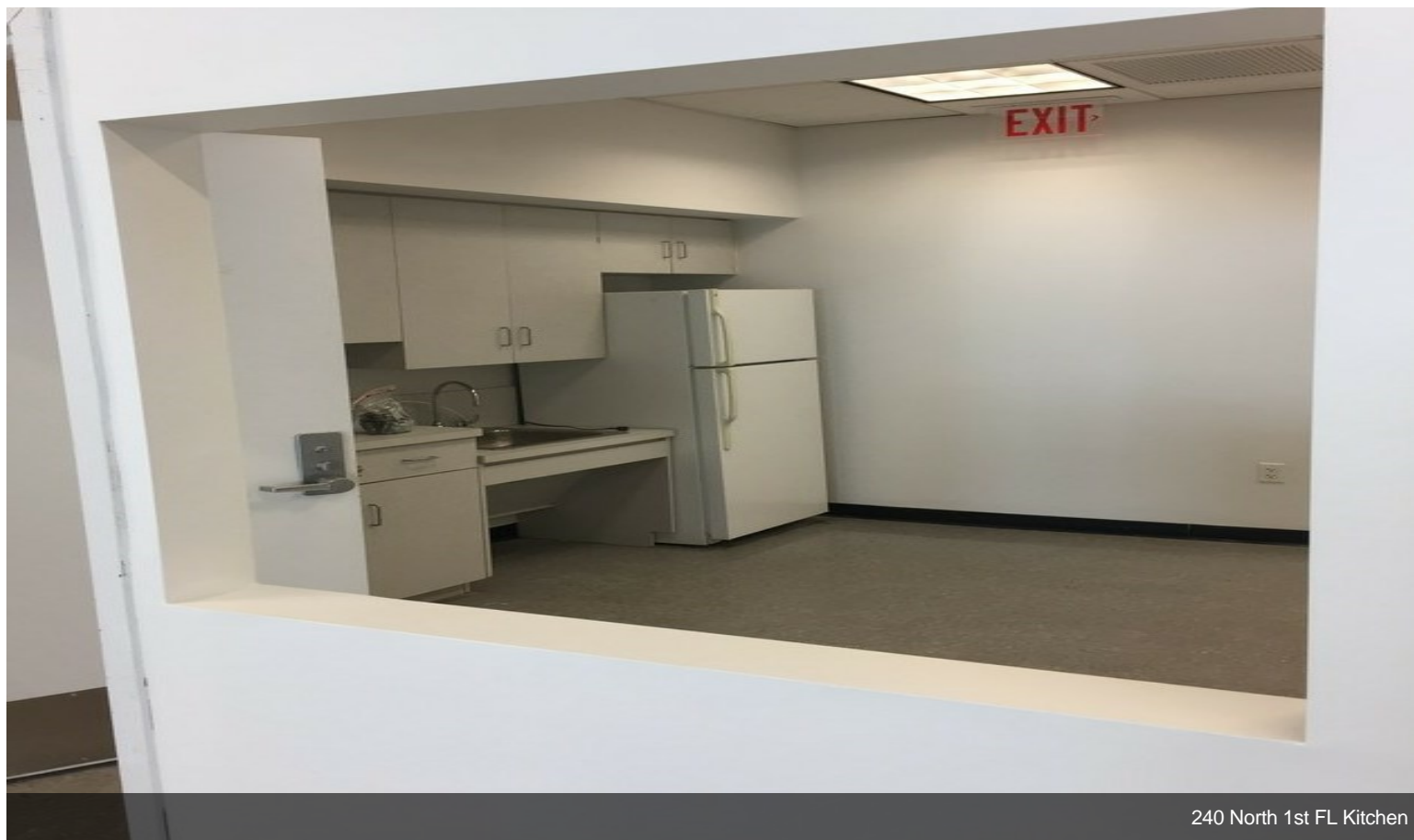
240 North 1st FL Kitchen