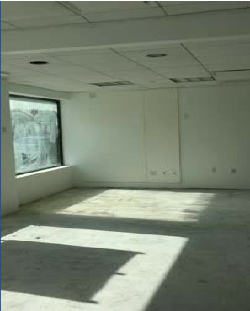
240 North 1st FL video