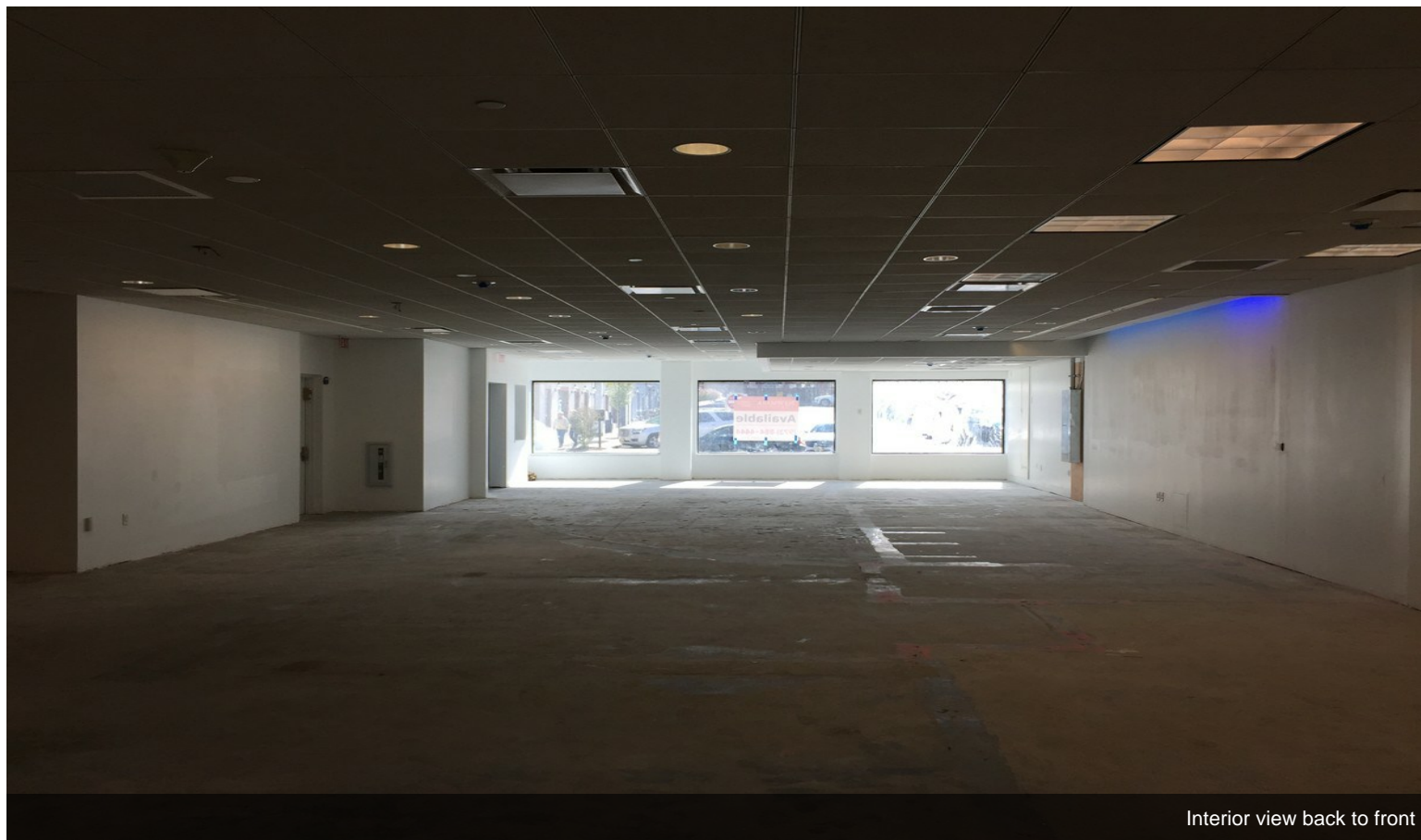
Interior view back to front