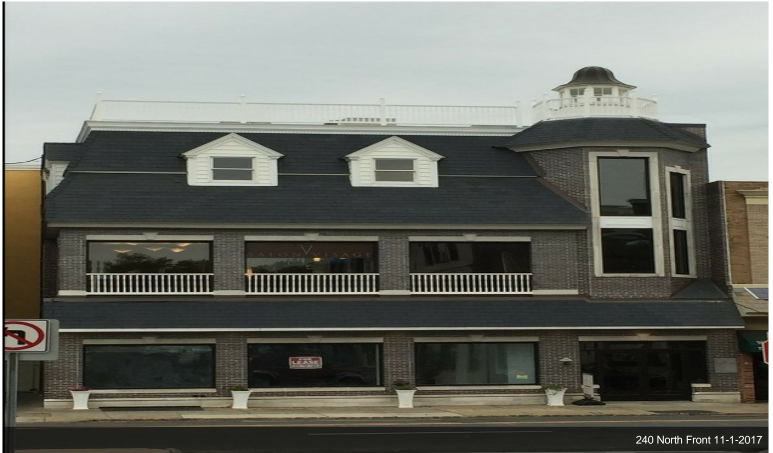
240 North Front 11-1-2017