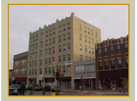
Tremendous views of Downtown St Cloud and Lake George

Views on all 3 sides and most every office has a window!