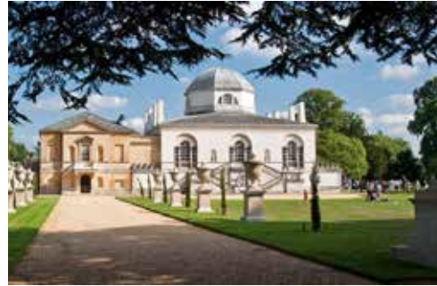
10. CHISWICK HOUSE & GARDENS