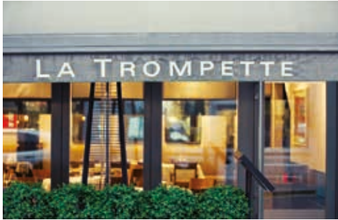
2 LA TROMPETTE