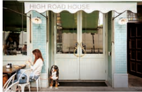
3. HIGH ROAD HOUSE