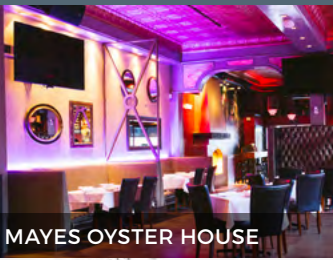
MAYES OYSTER HOUSE