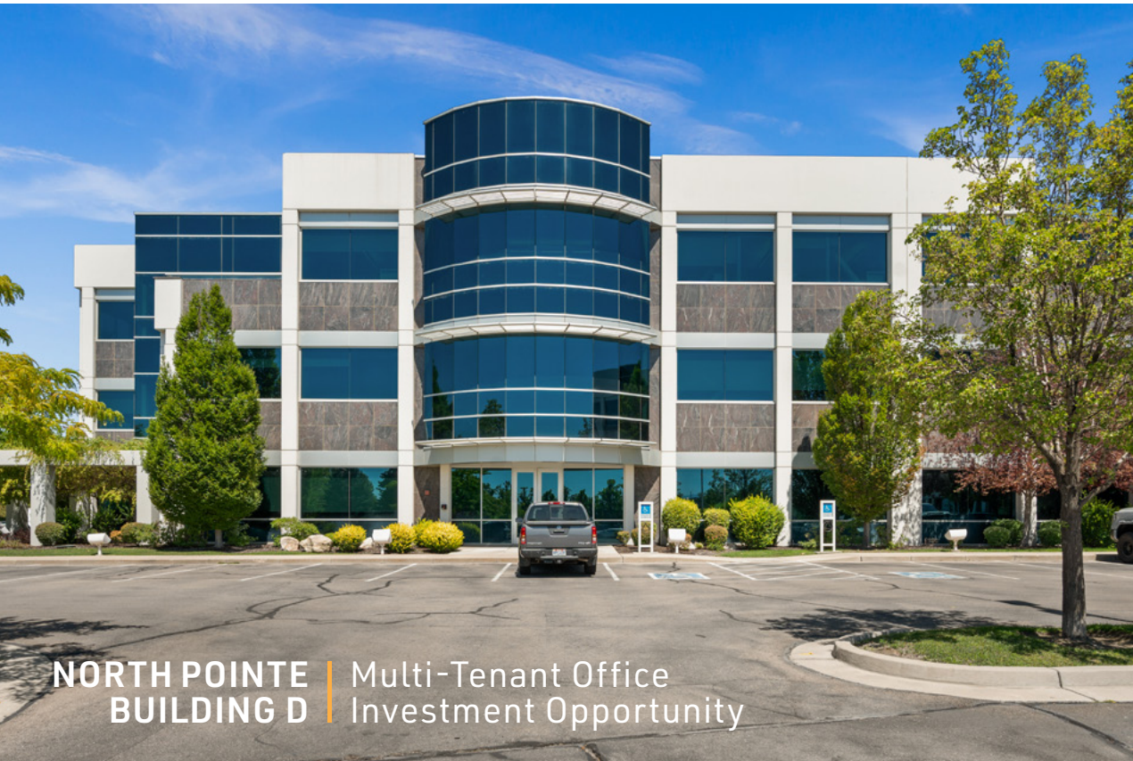
NORTH POINTE BUILDING D | Multi-Tenant Office Investment Opportunity

North Pointe D is well-positioned as an attractive value-add office investment in Utah County. The Property stands out due to its combination of existing income, leasing upside, functional parking, and accessible American Fork location. Located in the high-demand North Utah County submarket and benefiting from the continued expansion of Silicon Slopes, as well as a dense concentration of nearby retail, dining, and service amenities, the Property is supported by strong regional demographics, a growing employment base, and continued business expansion, offering investors the opportunity to grow NOI and unlock additional value through execution.