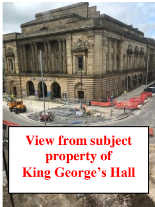
View from subject property of King George's Hall