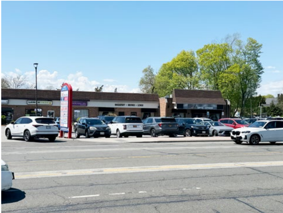
Shopping Center Photo