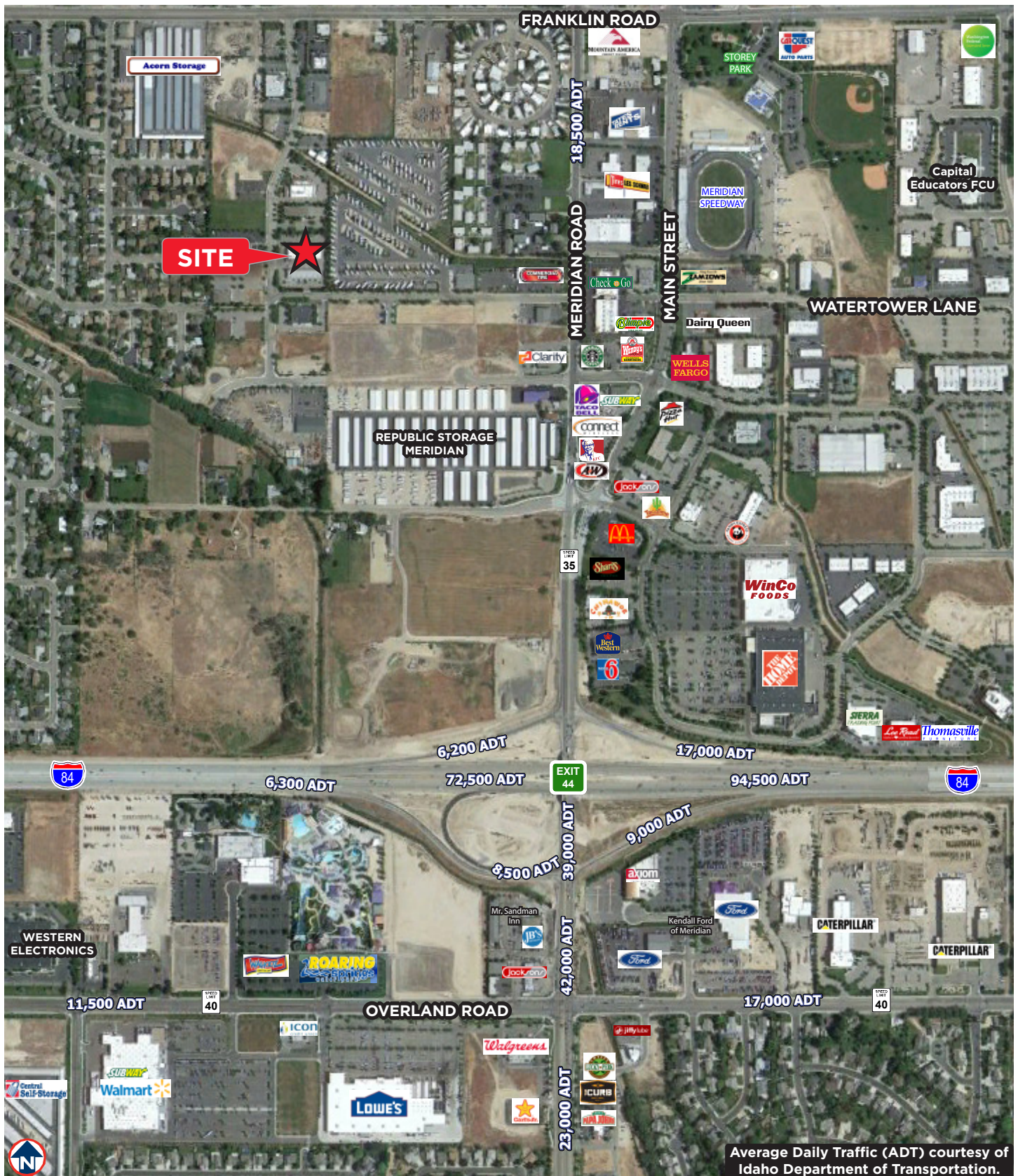
Average Daily Traffic (ADT) courtesy of Idaho Department of Transportation.

366 SW 5th Avenue, Meridian, Idaho 83642