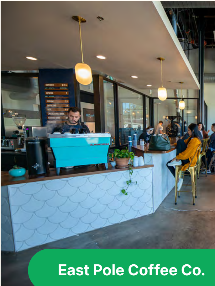
East Pole Coffee Co.