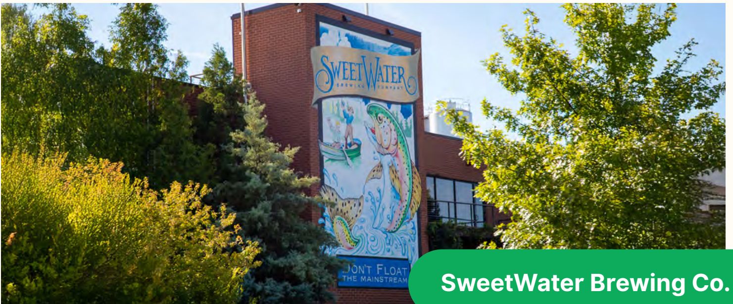
SweetWater Brewing Co.