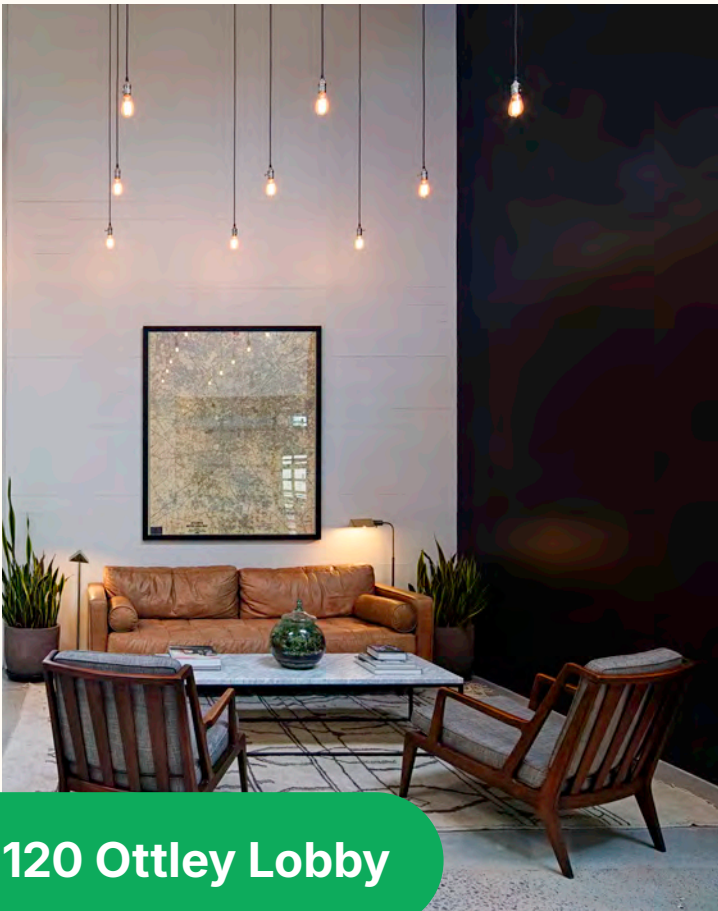
120 Ottley Lobby