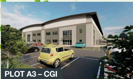
PLOT A3 – CGI

Units can be constructed to meet occupiers specific requirements.