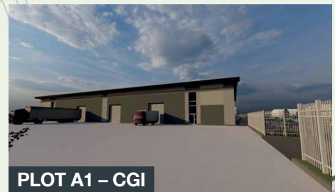
PLOT A1 – CGI