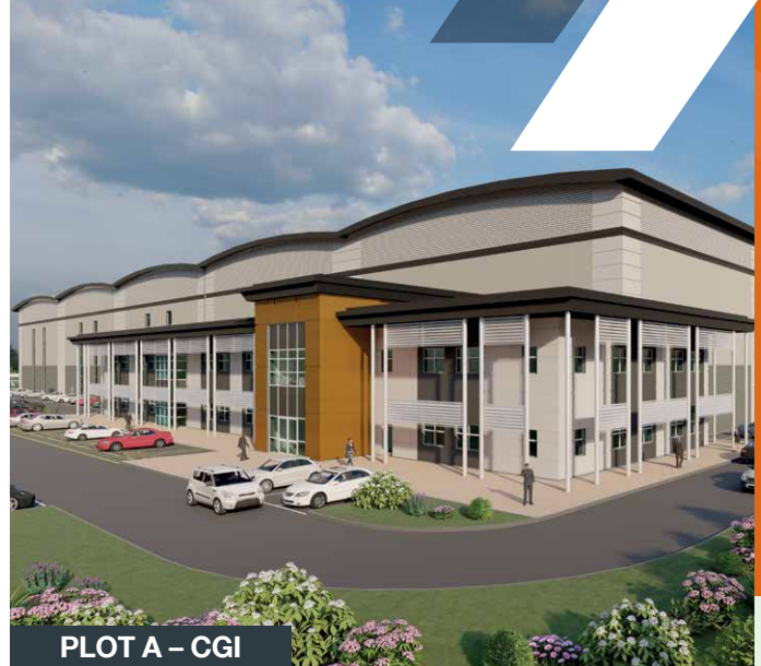
PLOT A – CGI