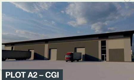
PLOT A2 – CGI