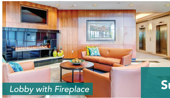
Lobby with Fireplace