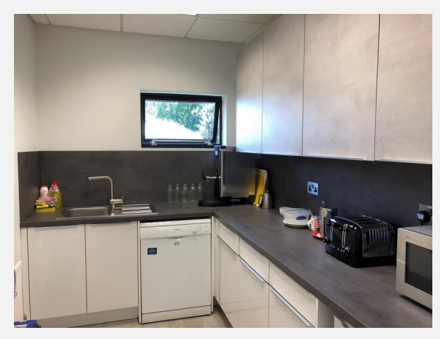
Shared kitchen on first floor