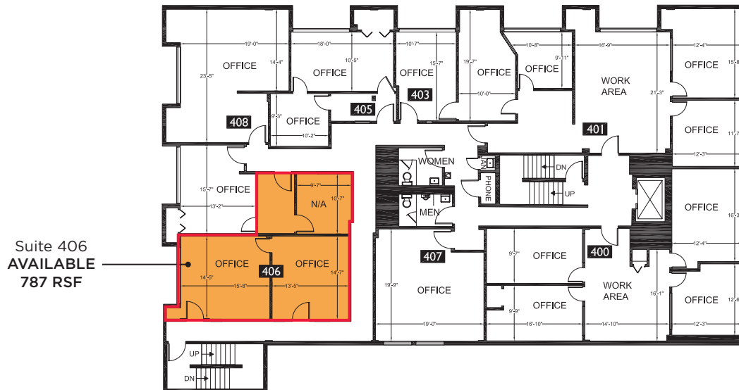
Floor Plan 4