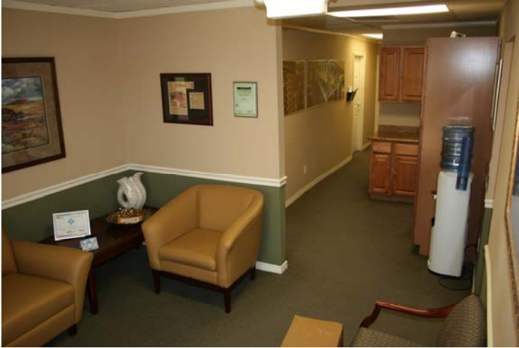
Sample Office Area