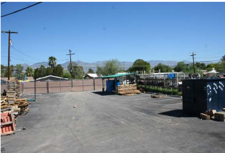
Yard / Parking Area