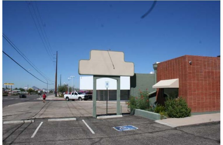
Existing Street Signage