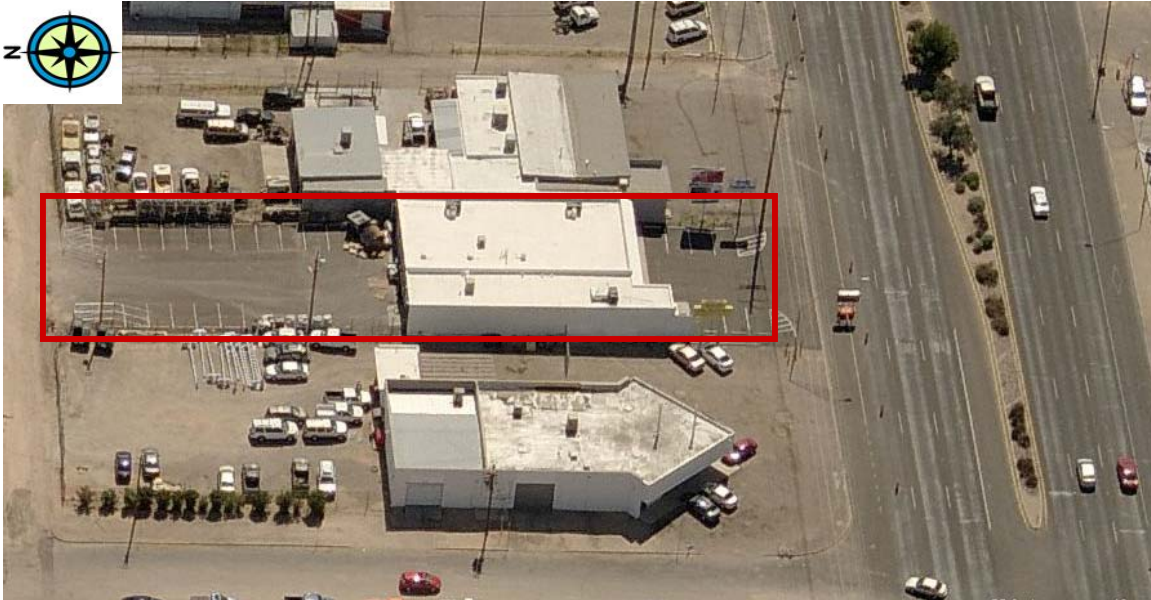
Side view of property