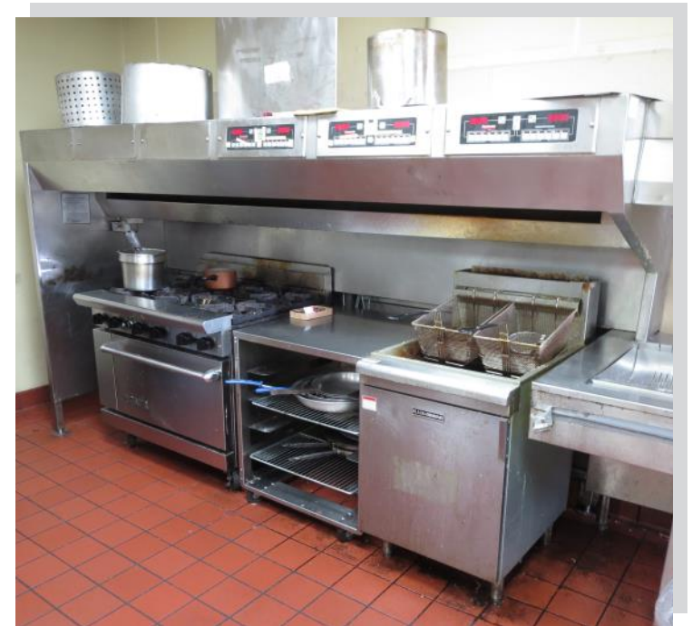
Large assortment of kitchen equipment