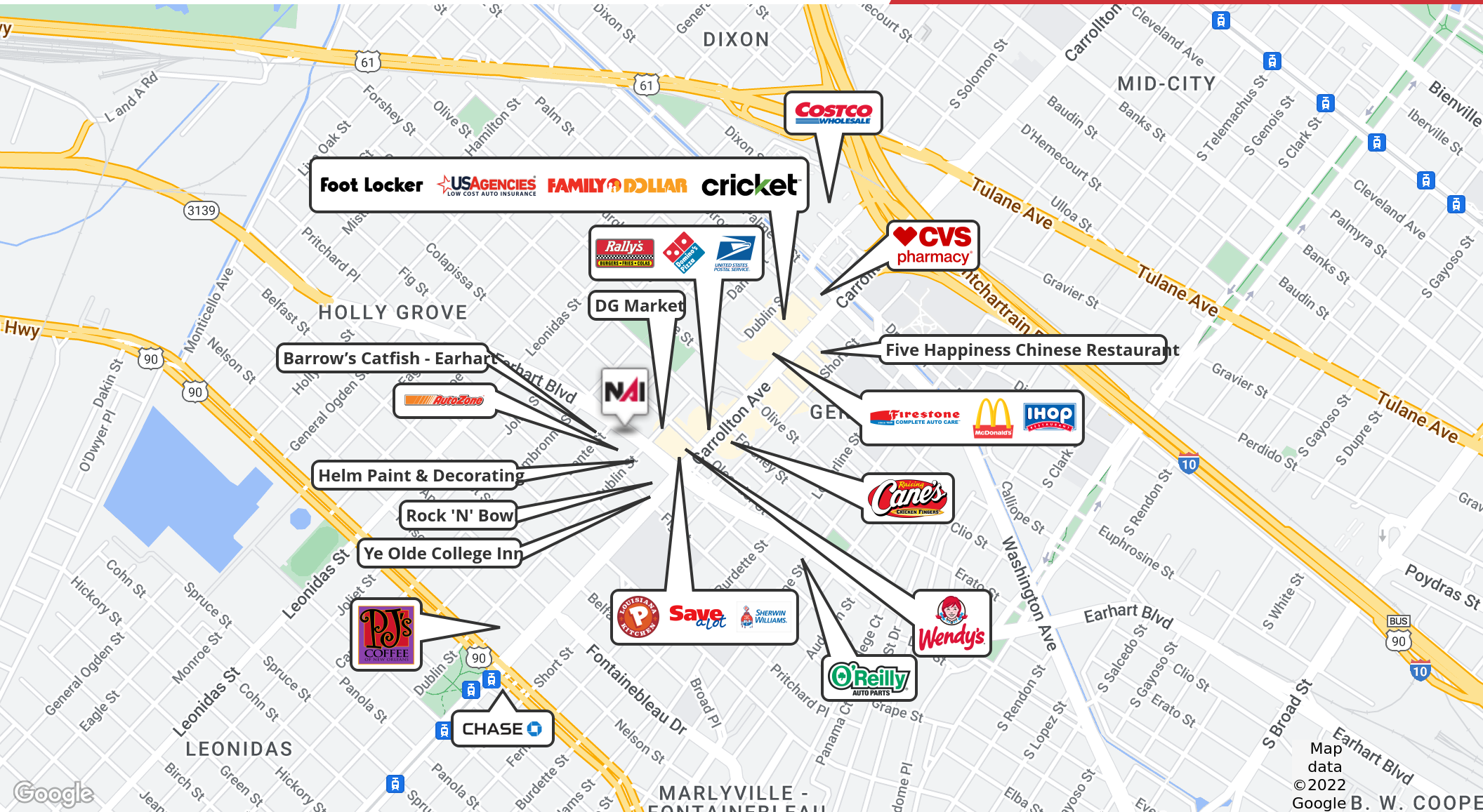
Map data © 2022 Google B. W. COOPER