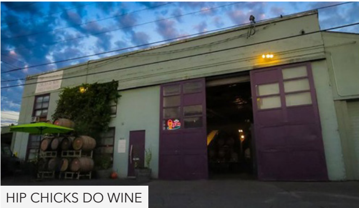
HIP CHICKS DO WINE