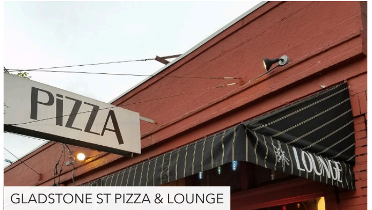
GLADSTONE ST PIZZA & LOUNGE