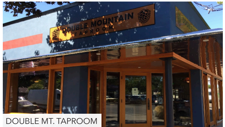
DOUBLE MT. TAPROOM