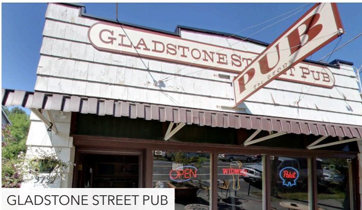
GLADSTONE STREET PUB