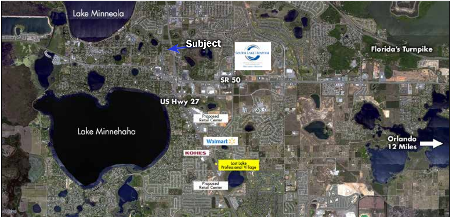
1, 3, 5 Mile Radius