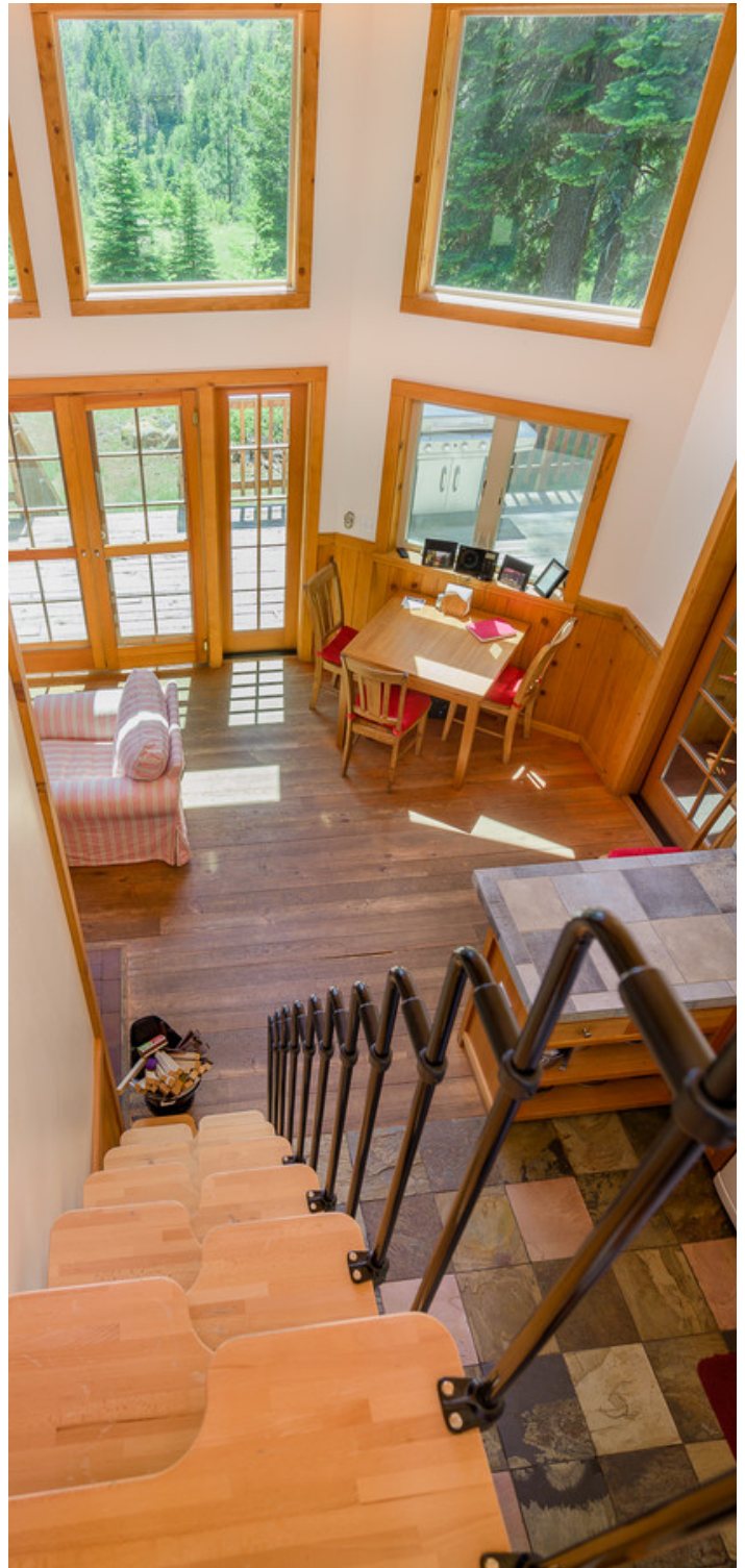
Luxury Cabin, Typical of 9 on the property