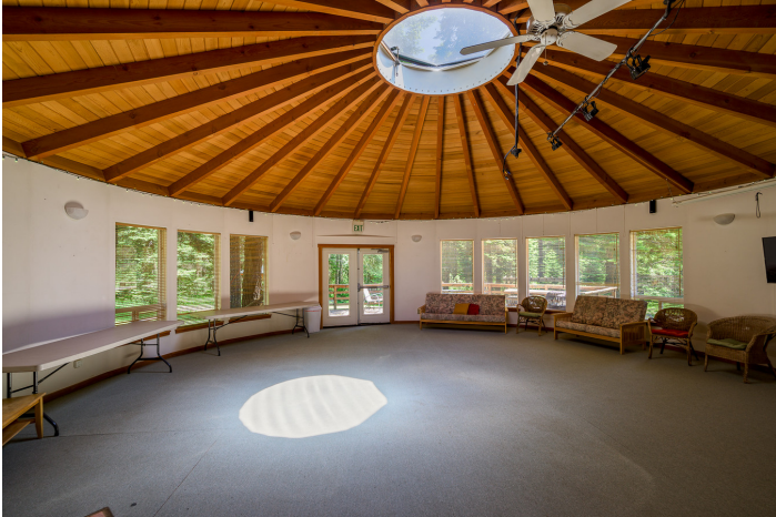
Meeting Room/ Yurt / Forest Room