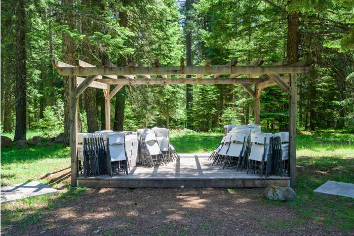
Events, Multiple Stages