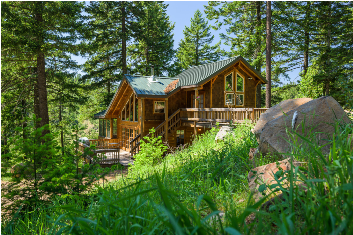
Luxury Cabin, Typical of 9 on the property