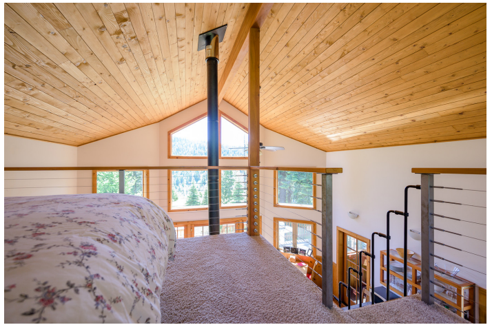
Luxury Cabin, Typical of 9 on the property