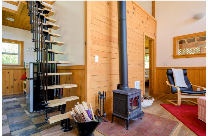
Luxury Cabin, Typical of 9 on the property