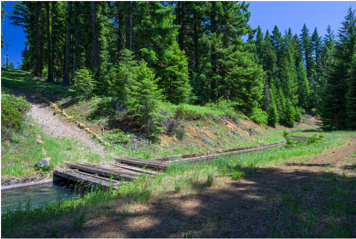
Talent Irrigation Ditch