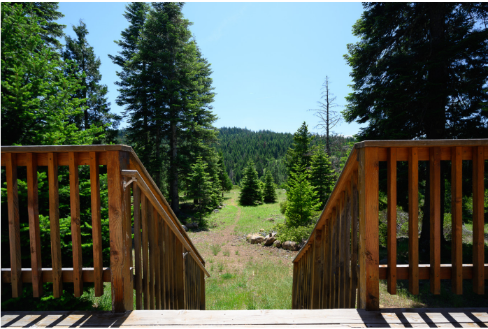
Luxury Cabin, Typical of 9 on the property