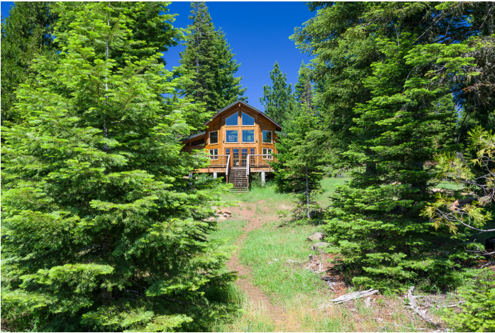
Luxury Cabin, Typical of 9 on the property