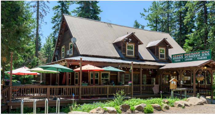
Green Springs Resort