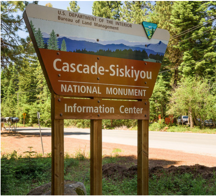
Cascade - Siskiyou National Monument