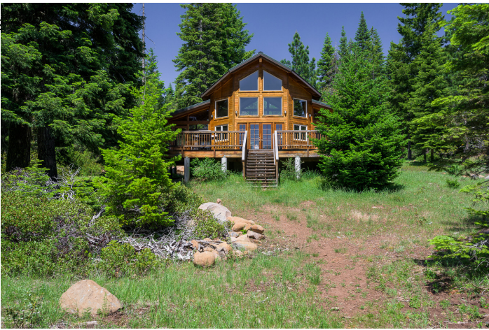
Luxury Cabin, Typical of 9 on the property