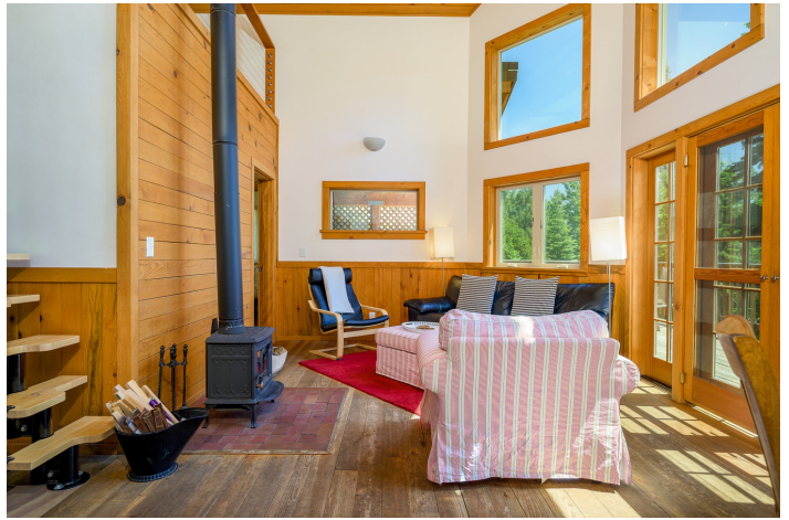
Luxury Cabin, Typical of 9 on the property