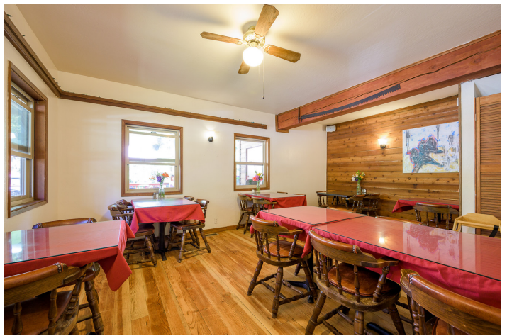
Resort Dining Hall